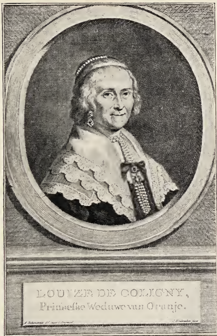
LOUISE DE COLIGNY.